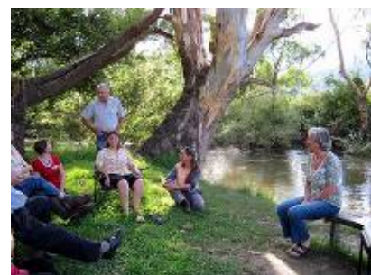
The session began on the banks of the Kiewa River, at the Kergunyah Reserve