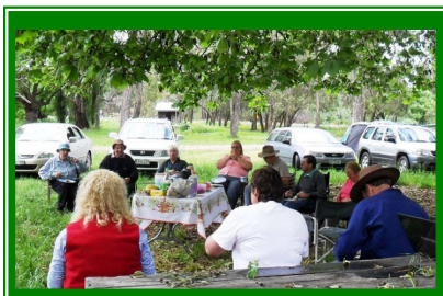
Photo: Landcare BBQ at Jamison Drive Reserve Baranduda