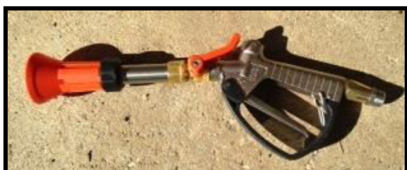
Photo: Spray Gun donated by Flower Macklan to go with our second automated reel

We were fortunate to receive funding through the Victorian Landcare Grants program to purchase a second automated reel with 100 metres of hose. This will be fitted by our volunteers to the spray unit over the coming months.