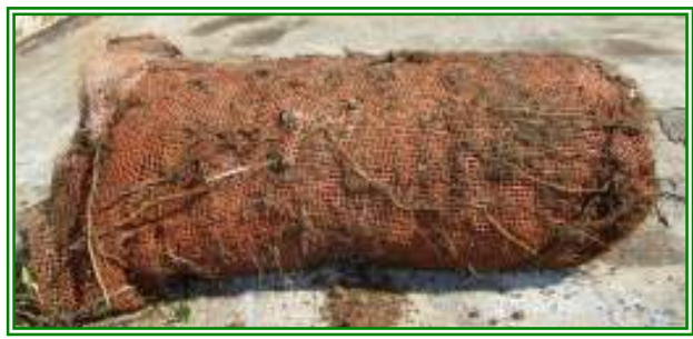
Soil core bag after it has been dug out of the soil. Note the root activity throughout the profile.

Numerous soil core trials were also established in the field. This consists of digging a hole (approx 2 -3 feet deep) and placing a mesh bag in the hole. The excavated soil is placed into the bag, with the top of the bag at ground level. Five pairs of G.spiniger beetles were placed at the top of the bag with some dung, and the bag was then tied off