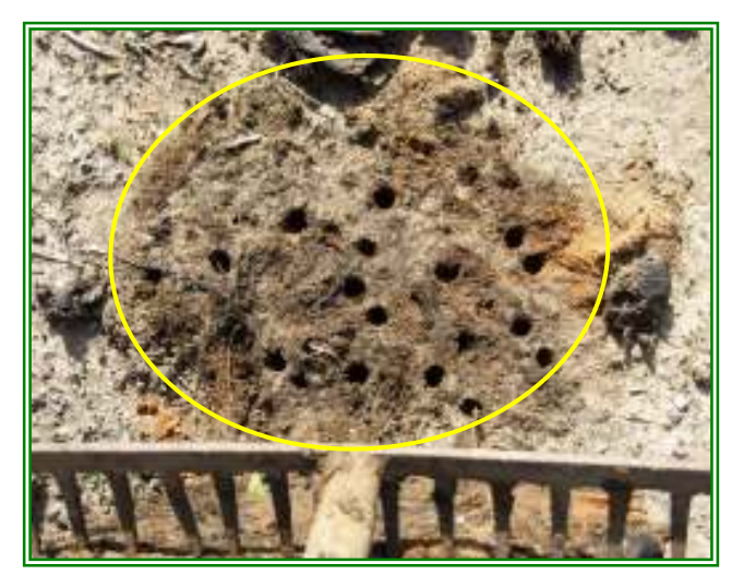
Bubas bison holes under dung pad 6/5/09 - Kergunyah

It is great to see this species become active in mid-Autumn. Bubas bison is a deep tunnelling beetle. When in the paddock look for soil casts around dung pads and tunnels (holes) under dung pads.