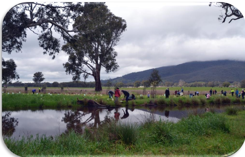
Billabong on the Middle Creek

KCLG actively seeks multiple opportunities and partnerships for our communities to learn about and contribute to restoring and protecting our land, soils and water. We lead, educate and enable people to ensure the Kiewa Catchment thrives into the future.