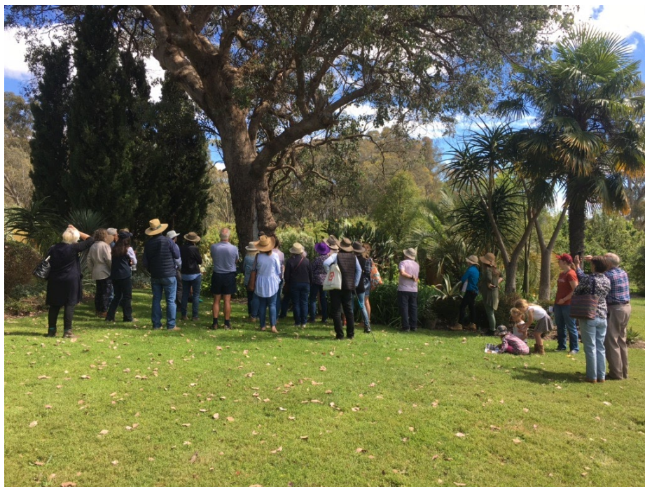
Photo showing participants looking at a potential scar tree on the Waddington property.